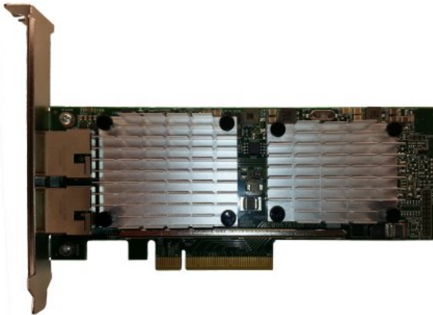
Figure 1. Broadcom NetXtreme 2x10GbE BaseT Adapter for System x

Figure 1 shows the Broadcom NetXtreme 2x10GbE BaseT Adapter.