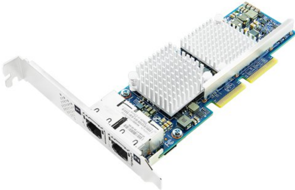
Figure 2. Broadcom NetXtreme II ML2 Dual Port 10GbaseT for System x

Figure 2 shows the Broadcom NetXtreme II ML2 Dual Port 10GbaseT adapter.